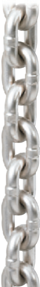
Load chain wear comparison

KITO's world class original super-strength nickel-plated load chain certified by German Institute, uses unique technology to greatly increase resistance to fatigue and wear.